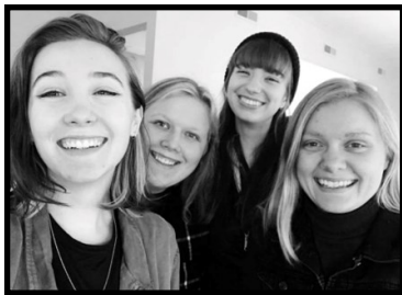
A photo of my church "gal pals" & I